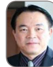
Yongsit Rojsrikul Governor Mass Rapid Transit Authority of Thailand