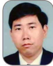
Sokhom Pheakavanmony Secretary of State Ministry of Public Works and Transport, Kingdom of Cambodia