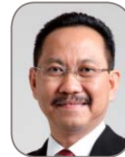
Bambang Susantono Vice Minister of Transportation Ministry of Transportation, Indonesia