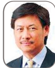
Prapat Chongsanguan Governor State Railway of Thailand