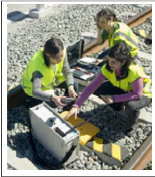
Figure 3. Complementary Tests Execution.

As a conclusion we can state that, through the implementation of complementary tests, it has been proven that once corrected the detected problems in these tests, no relevant functional problem has appeared during the later commercial exploitation. This is the best indication of the usefulness of these aforementioned complementary tests in the deployment of the ERTMS in Spain.